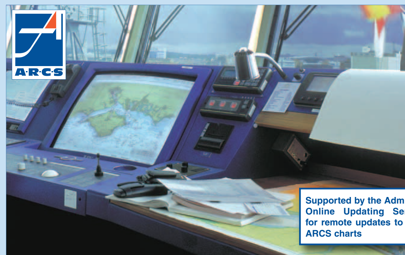
Typical ARCS bridge display

The Admiralty Raster Chart Service (ARCS) offers the mariner an exact digital reproduction of the Admiralty paper chart for use within electronic navigational systems (see pages 9-10). Charts are supplied on regional CD-ROMs and are accessed via electronic permit keys.